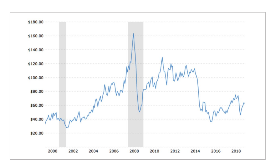
Figure 1. Oil prices, from 2000 to 2018 (WTI crude, US$ per barrel). WTI = West Texas Intermediate.

natural resource rents accounted for nearly 13% of South Africa's GDP (World Bank, 2019). Kazakhstan began oil extraction at the Tengiz oilfields in the western region of Mangystau in 1998. Since that time, Kazakhstan's level of resource dependence has been substantially higher than that of South Africa, with the percentage of GDP being accounted for by natural resource rents peaking at 32% in 2008 (World Bank, 2019). In the year of the Zhanaozen massacre (2011), more than 27% of Kazakhstan's GDP came from natural resource rents; in the year of the Marikana massacre (2012), just 7% of South Africa's GDP came from natural resource rents (World Bank, 2019). Nevertheless, as Figures 1 and 2 suggest, both economies were hit hard by the steep decline in global commodity prices in 2008-2009 following a steady rise in prices over the preceding 6 years. The decline coincided with Kazakhstan's GDP growth rate falling from more than 9% in 2000-2006 to just 1.2% in 2009 and with South Africa's GDP contracting by 1.5% in 2009.