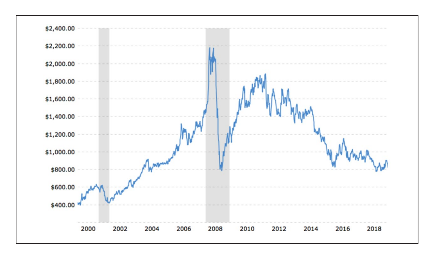
Figure 2. Platinum prices, from 2000 to 2018 (US$ per troy ounce).

makes sense that the timing is related to the boom—bust cycle reflected in Figures 1 and 2. In the period immediately following the "bust," workers were already eager to jettison wage restraint, whereas their employers remained uncertain about the recovery and were still in the process of trying to stabilize revenue. It is precisely within this window that the strike waves in Kazakhstan's western oilfields and South Africa's platinum belt unfolded. Yet, demands for higher pay are nothing new, nor is resistance to wage increases on the part of employers. This section focuses on certain distinctive features of the extractive sector that complicated efforts to maintain industrial peace.